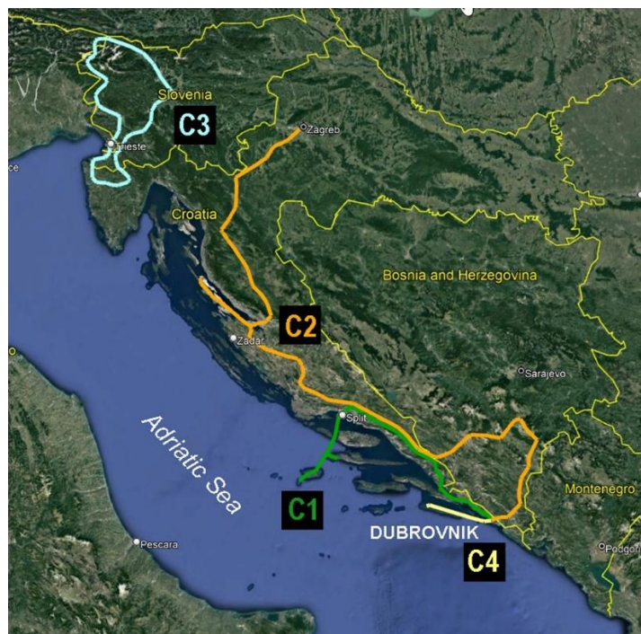
Post-conference field trips